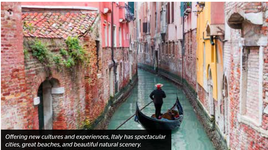
Offering new cultures and experiences, Italy has spectacular cities, great beaches, and beautiful natural scenery.

You'll have to prove to the French authorities that you have a pension or other means of financial support, as well as a health plan to meet the cost of healthcare.